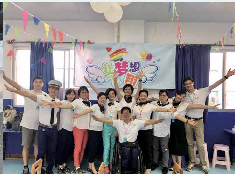
The theme of this activity was "Let the Dreams Fly". Our mission team from Singapore transformed into the crew of "Dream" and chased the dreams with the children.

In preparation for our visit, we encountered many obstacles including application processing, unstable electricity at the Care Center due to construction and very rough roads when we traveled around the Center. Even though we experienced many