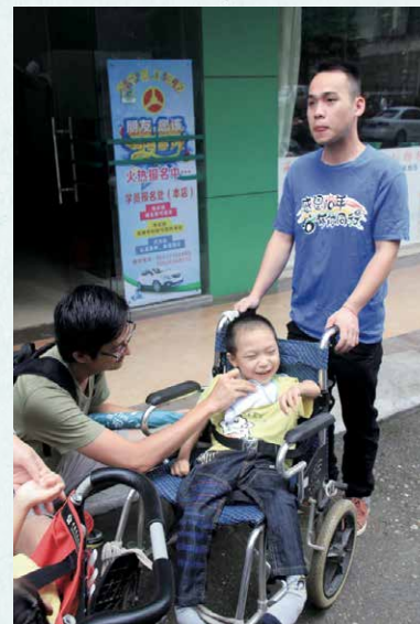
After visiting the Rehabilitation Center, we took the children with Cerebral Palsy to a outing trip.