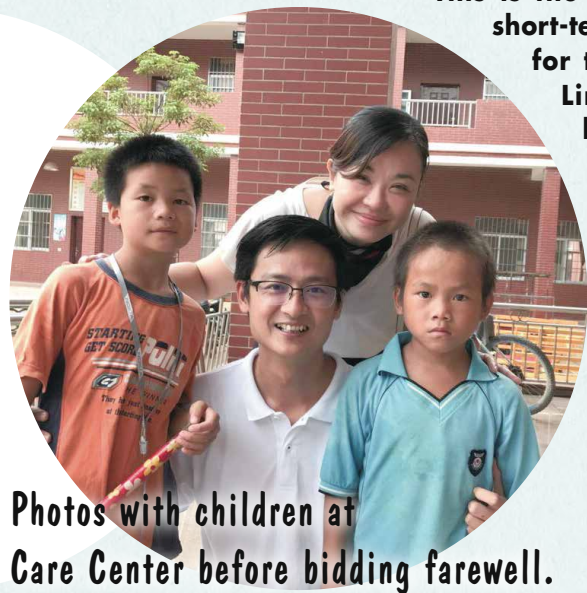
Photos with children at Care Center before bidding farewell.

What surprised me was how different the children from Silver Lining were from my expectations. Usually, orphans tend to be quiet and timid with strangers and have a strong sense of self-defense. In contrast, the children at Silver Lining are very considerate, smart, and independent. During different activities, they would tidy up without being asked. They are also very considerate for others - getting us water when they saw us sweating. Although we did not have much time to spend together, we could see how Care Center has influenced them by their love, caring and nurturing support.