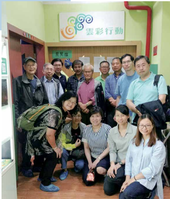
My church brothers and sisters and me (center, front row) visits the Rehabilitation Center.

As a neurology specialist, it was a pleasure to share with tutors and parents at the Center. I can imagine it is not easy to take care of children with Cerebral Palsy. If a child has epileptic seizure, the parent's pressure is even more intense. I believe they have many concerns and questions and I hope that this article will be able to answer some of them: