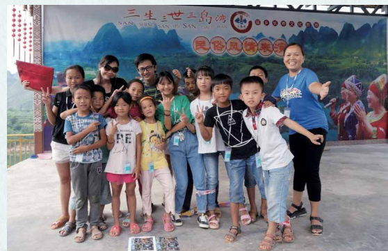
Teaching children the spirit of cooperation and to face the challenges through games.

The most overwhelming experience during the visit was joining a class with children with Cerebral Palsy. We saw that the Center was able to provided a positive impact and give love and hope to these children. I witnessed how God delivers His blessings to many people through Silver Lining - not only the children but also people around them which bring hope to families in poverty. I would like to encourage everyone to support and join the work at Silver Lining, where you share the blessings with others and enrich lives!