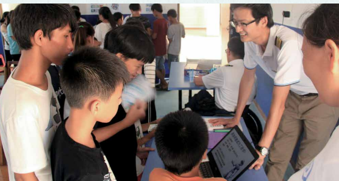
Our team introduced the children different work industries in the form of working, broadening children's horizons.